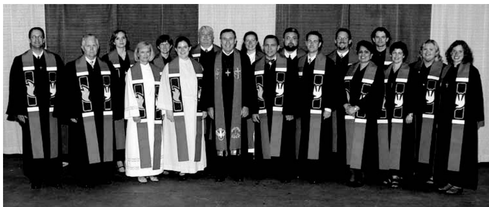
ELDERS IN FULL CONNECTION Elders in Full Connection