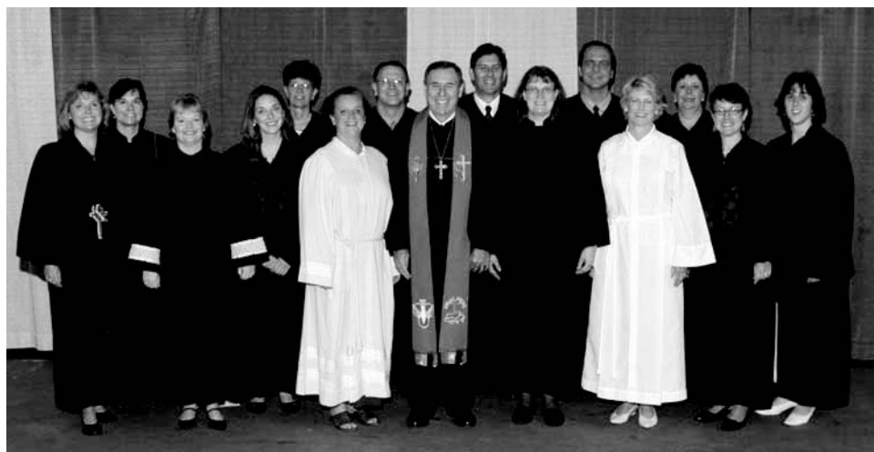
PROBATIONARY MEMBERS Probationary Members