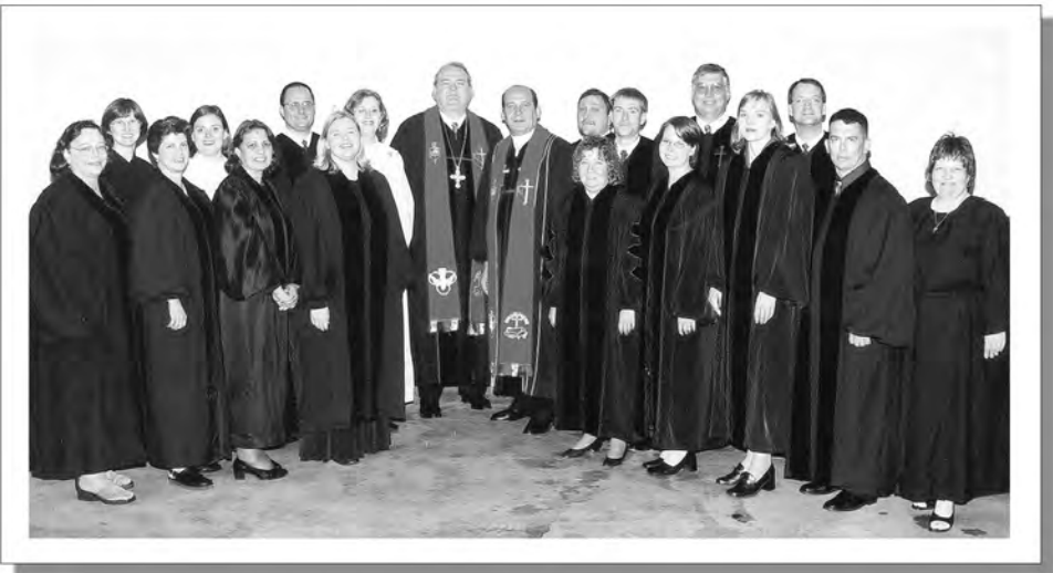
PROBATIONARY MEMBERS Probationary Members