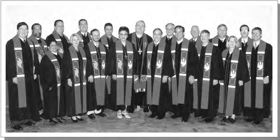
ELDERS IN FULL CONNECTION Elders in Full Connection