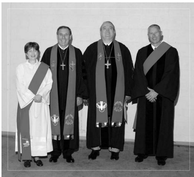
DEACONS IN FULL CONNECTION