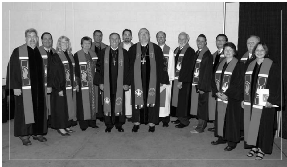
ELDERS IN FULL CONNECTION