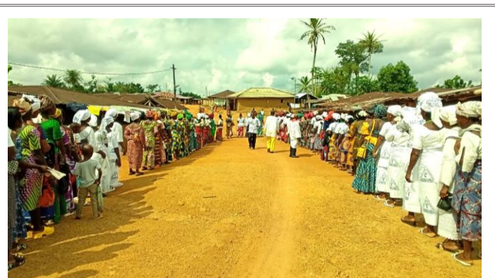
Marching to the closing worship service of the Nana Kru District Annual Session in Diyankpo, Sinoe County. Dec. 10, 2023.

Hundreds of people went into the streets demanding justice. They believed that his illness and death were planned by people opposed to him. The house for the traditional council was set on fire. I turned back from my walk when I saw flames engulfing the building. All students were sent home, and schools and businesses were closed for the day in Zwedru. We are thankful that calm was restored by the afternoon and the next day schools and shops were open. I lift Liberia in prayer for continued peace.