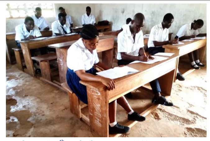
Zwedru UMS 10<sup>th</sup> grade class. Dec. 4, 2023