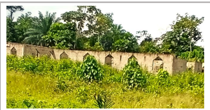
New Toe Gbardee UMC under construction. Dec. 10, 2023.

Early in the morning of Tuesday, December 5<sup>th</sup>, I was awakened by the crying of women. It was the crying women do when someone dies. I thought someone in the community died, but when it was light and I went outside, I found out that the person who died was the newly elected representative, Madison Gwion. He would have been installed in office that Friday.