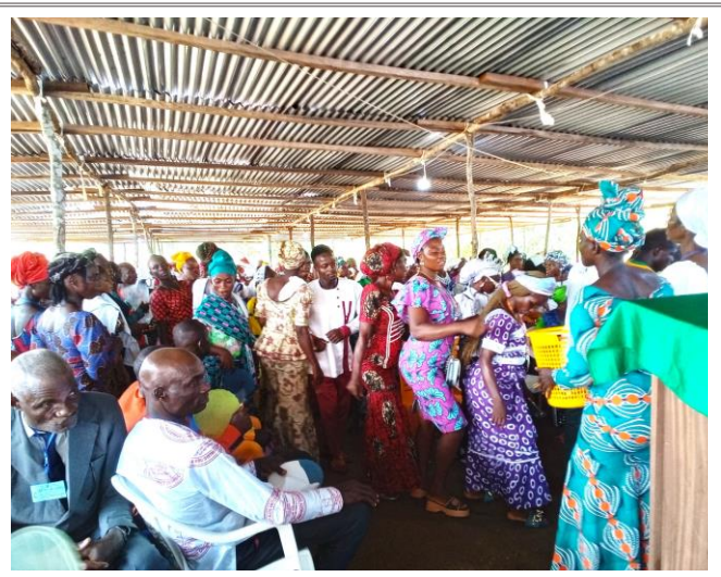
Dancing to the offering basket during the closing worship service for the 83<sup>rd</sup> District Annual Session of the Nana District Conference. Dec. 10, 2023.

It took one week to build this shelter next to the Toe Gbardee UMC to hold all the 468 delegates at the 83<sup>rd</sup> District Annual Session of the Nana District Conference. Dec. 10, 2023.