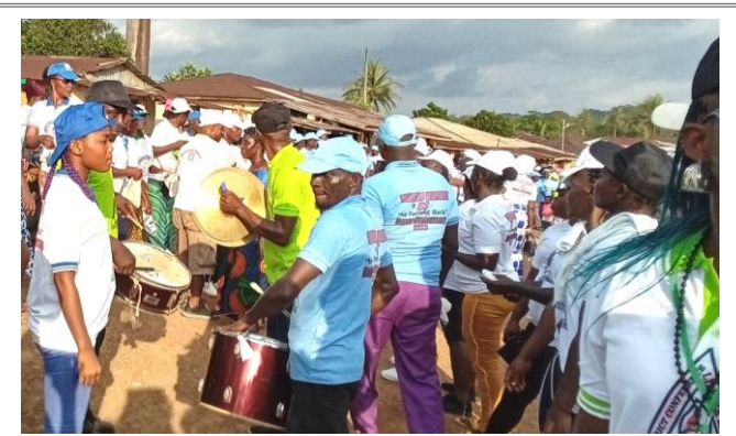
The streets in Diyanko filled with people to see the Nana Kru District members parade to the football field. Dec. 9, 2023.

All the church choirs participated in a singing contest. Nana Kru District gatherings also include a parade and a football game. While men beat drums, we sang and danced our way to the football field (which was originally an airstrip). The host church, Toe Gbardee United Methodist Church (UMC), played against the Nana Kru District team. It was a close and exciting game. In the end, the district team scored the only goal. The goalies were great!