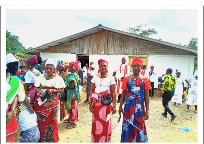
In front of Toe Gbardee UMC, Diyankpo. Dec. 10, 2023.