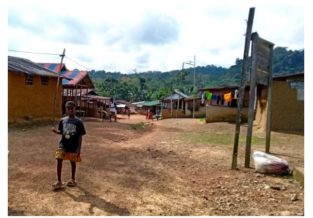
A typical street in Diyanko. Dec. 10, 2023.