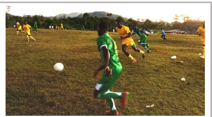
For the football game, the host church, Toe Gbardee UMC, in green played against the Nana Kru District team in yellow. Dec. 9, 2023