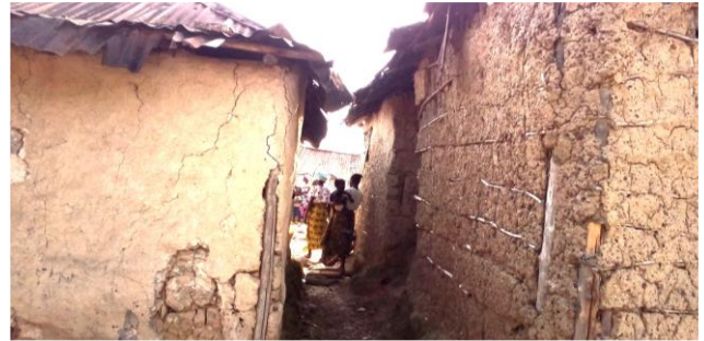
January 31, 2023