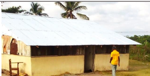
Harrison Grigsby UMS administration building with new roof thanks to gifts to The Advance #3020670.