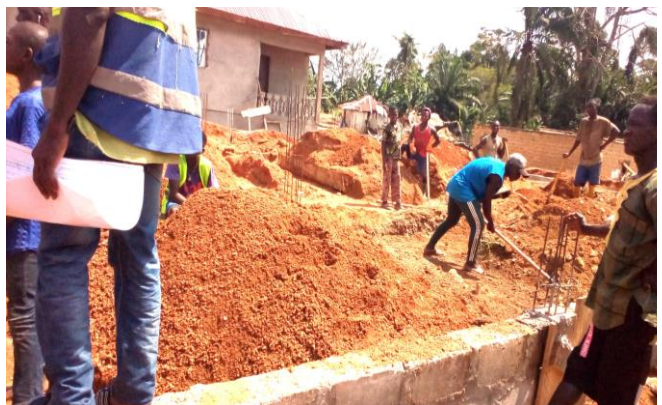
The residents of Boway are working to upgrade their standard of living by replacing their mud houses (photo above) with houses made from cement blocks. The families who will live in the new homes are contributing to the building process. January 27, 2023.