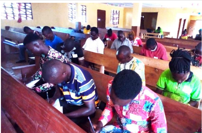
The teacher training participants working on an assignment. January 27, 2023.