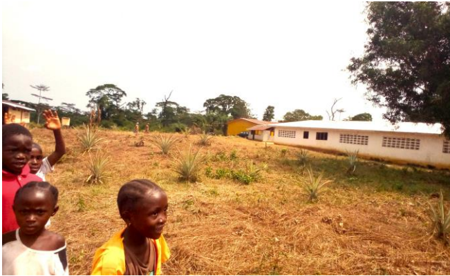
As an income generation project, the students at the Obelia Scott Ross United Methodist Elementary School planted 225 pineapple plants. January 27, 2023