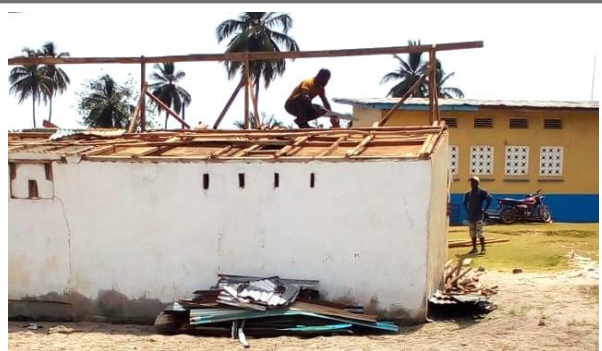
Harrison Grigsby UMS administrative building without roof after storm in January 2023.

January is in dry season, but in Sinoe, it can rain anytime. A January rainstorm blew off the zinc roof of the administration building at Harrison Grigsby UMS in Greenville. This building houses the staff lounge, and offices for the registrar, business manager, and vice principal for administration.