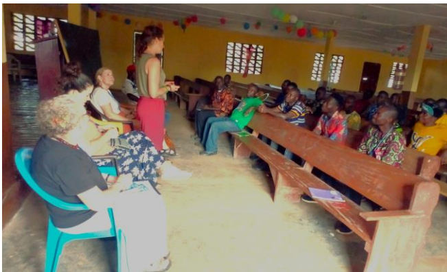
Teacher training facilitated by teachers from Mt. Horeb UMC held in the church building in Boway, Bong County. January 27, 2023