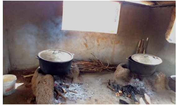
Pots on the fire in the Obelia Scott Ross UMS kitchen. Meals were prepared for the teacher training participants. January 29, 2023