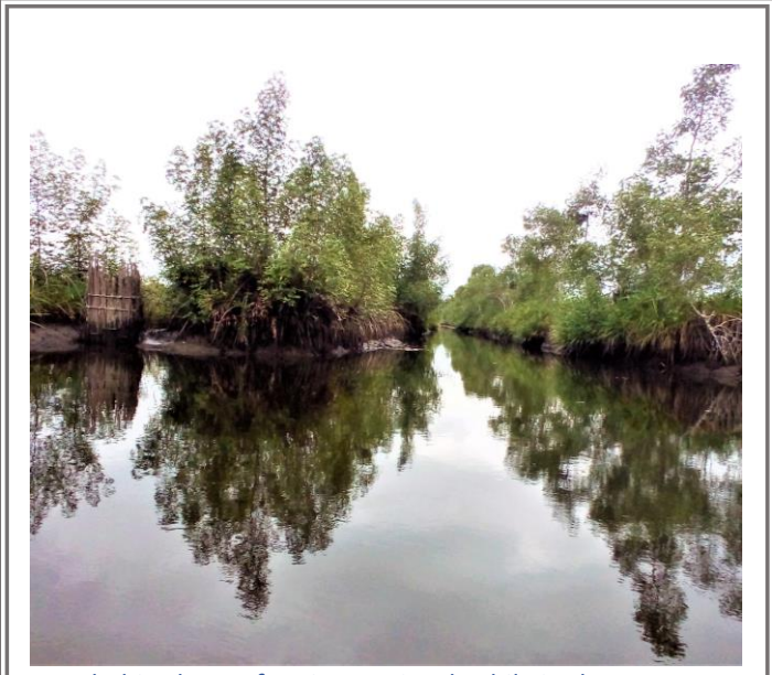
I took this photo of Lexington Creek while in the canoe going to church.