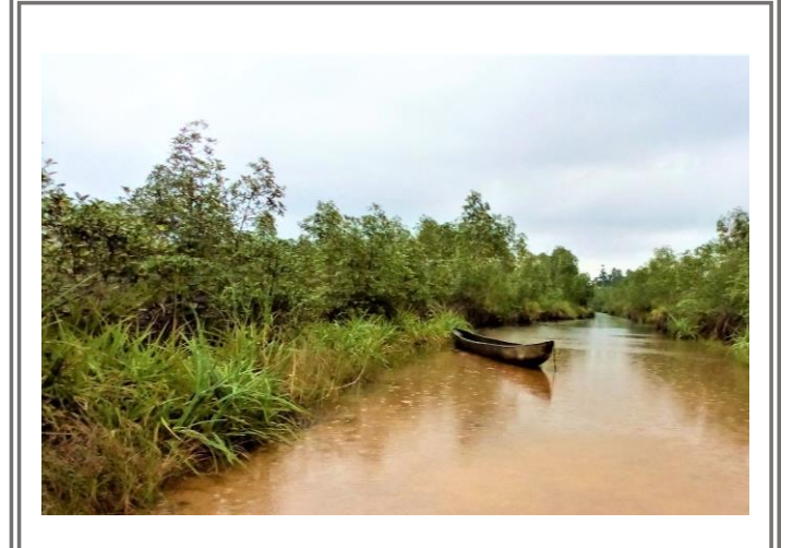
The canoe for public use on Lexington Creek.