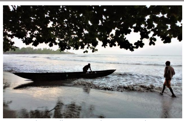
I went in this small canoe to a larger canoe that was waiting further out in the water for the trip from King William's Town to Greenville. May 31, 2022

Construction of New School Buildings #3020670 Missionary Support #3021129 Operation Classroom # 3020494 Scholarships #15125B https://advance.umcmission.org