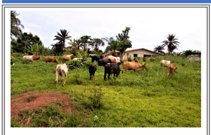
Cows walking through the unfenced campus of Zwedru UMS. April 22, 2022