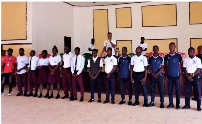
The Sinoe Multilateral High School quizzing team is on the left and the Harrison Grigsby UMS team is on the right, January 15, 2022. Four of our quizzers are Operation Classroom Scholars.

The rest of the month I was on the road. I visited all 5 United Methodist Schools in beautiful Grand Kru County, and I found that every school has serious building concerns. This means that all 11 schools in the 4 counties in which I am now working have building needs. Thank you for gifts to The Advance #3020670 to help meet these school building needs.