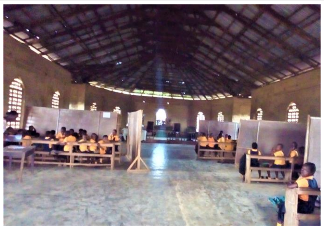
The J. B. Robertson United Methodist Church building is next to the shell of the David Tweh Toe UMS building. The church building is partitioned for the classes on school days. January 27, 2022

Thank you for supporting education in Liberia by giving to