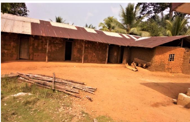
Thomas Brewer United Methodist Elementary School, Behwan, Grand Kru County uses the church building and has classrooms in this mudbrick building. January 24, 2022