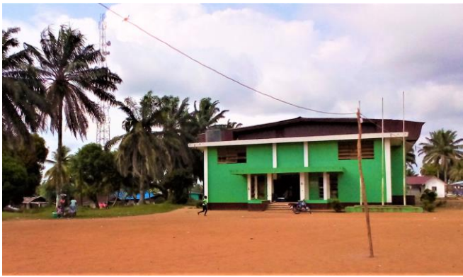
The Greenville City Hall is the venue for quizzing competitions, wedding receptions, school graduations, and other large gatherings. The Liberia Annual Conference was held here in 2013.