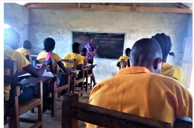
Students in the 9 grade class at the J. J. Dickson United Methodist Elementary, Junior & Senior High School in Barkclayville, Grand Kru County, January 26, 2022. This school began as an elementary school and added a high school annex for grades 10, 11, and 12. The women of the local church started a 3-classroom mudbrick building for the nursery, Kindergarten 1 and Kindergarten 2 classes.