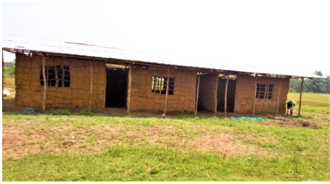
3-classroom annex under construction at the Anna E. Hall Elementary & Junior High School in Garraway Beach, Grand Kru County. This mudbrick building will be plastered inside and out and a concrete floor will be poured. January 24, 2022