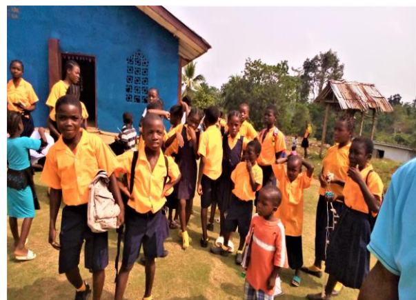
Students of the Thomas Brewer UMS in front of the church building during recess, January 24, 2022.