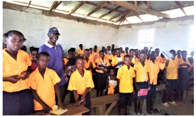
The first and second grade teacher at Anna E. Hall UMS in a crowded combined classroom with 82 students. Other classes are also combined. The annex will ease the overcrowded classrooms. January 25, 2022