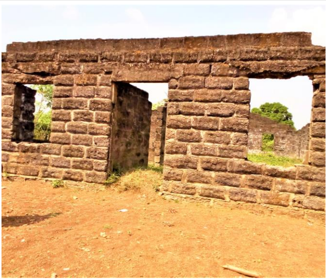
The David Tweh Toe United Methodist Elementary School building in Grand Cess, Grand Kru County.