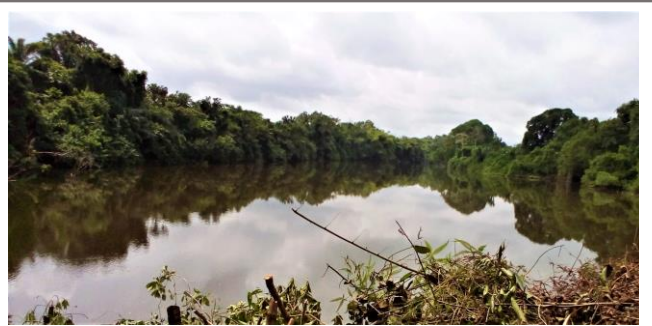
The Sinoe River at Jack Town Mission, December 28, 2021. The river is the road from Greenville to the Mission.

We are grateful to the Flanagan UMC and others in the Illinois Great Rivers Conference for their financial and prayer support for this school building. The toilets need to be installed, columbo blocks need to be put in the windows, and more chairs and tables need to be made but we are thankful that the school is open, and children are in class learning.