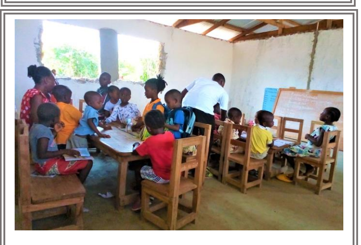
Combined nursery and kindergarten class at Flanagan UMS, Fish Town, River Gee County, December 3, 2021.