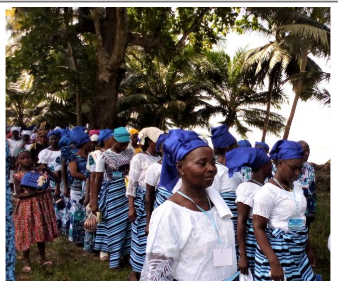
Women processing to church for closing worship service of the Nana Kru District Conference, December 12, 2021.