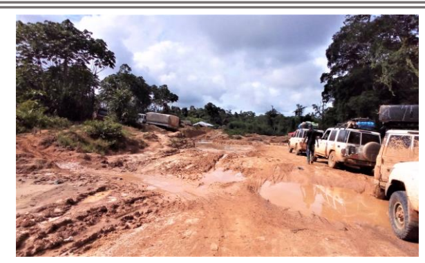
Land Cruisers lined up in mud on the way to Greenville, Sinoe County, October 18, 2021.