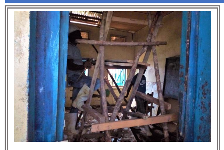
Renovation work at Harrison Grigsby UMS in preparation for the opening of school, October 19, 2021.