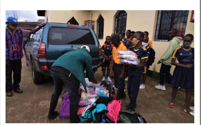
Distributing gifts from the Holston Conference at the C. W. Duncan UMS in Clara Town, Bushrod Island, July 2, 2021.