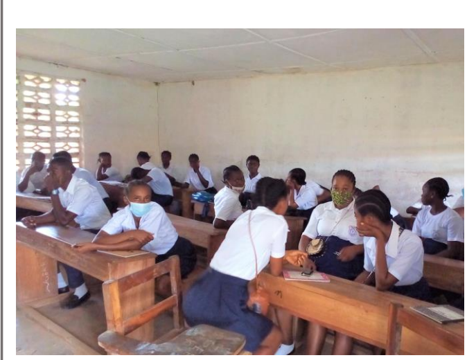
High school class at Zwedru UMS, Grand Gedeh County, July 29, 2021.