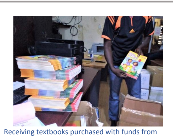
EmK- Weltmission, July 22, 2021.

We thank the EmK-Weltmission (Evangelish methodistiche Kirche-Weltmission/ Evangelical Methodist Church-World Mission) for offering to give 60,000 Euros for us to purchase textbooks for schools in the United Methodist School System. I went through the Ministry of Education's curriculum and listed books from 1<sup>st</sup> through 12<sup>th</sup> grade that could be purchased in bulk in Monrovia. Students in 12 schools that had insufficient, or no textbooks will have textbooks for the new school year.