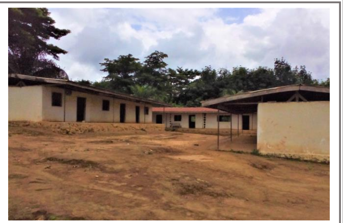
Gbedin UMS, Gbedin, Nimba County, July 9, 2021.