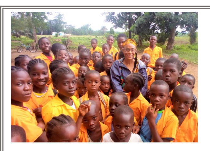
Students at Garr UMS in Garr Dingamon, Nimba County, June 15, 2021.