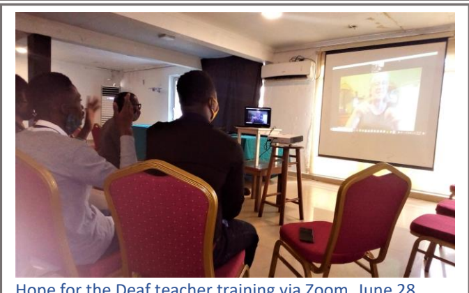
Hope for the Deaf teacher training via Zoom, June 28, 2021.

GLOBAL MINISTRIES The United Methodist Church