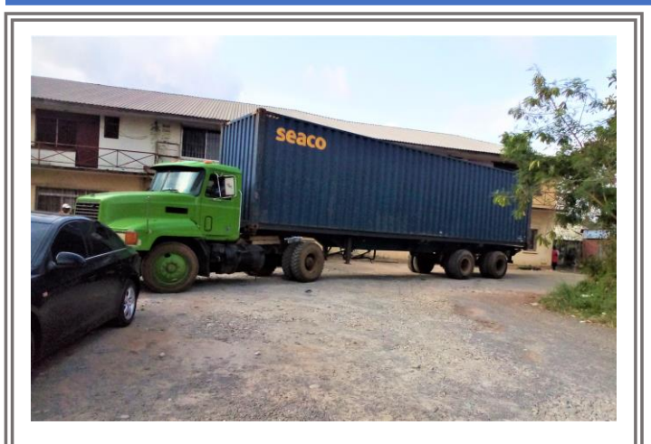
Container from Holston Conference arrives at the Liberia Annual Conference Central Office, August 5, 2021.