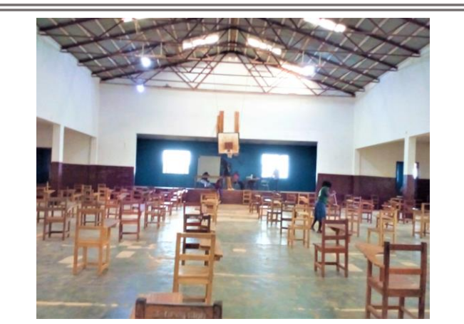
Gym at William V. S. Tubman-Gray UMS, Gbarnga, Bong County, set up for the WASSCE, September 15, 2021.

12<sup>th</sup> grade students in Liberia took the WASSCE from September 10 through September 30 along with the other four West African anglophone countries- Gambia, Ghana, Nigeria, and Sierra Leone. Several of our United Methodist Schools were used as examination centers because of their seating capacity. I visited W. V. S. Tubman-Gray UMS during the WASSCE. Chairs were arranged in the gym and 12<sup>th</sup> grade students from other schools came to take the exams along with our Tubman-Gray students. We are waiting for the results which will determine if students are eligible for high school graduation.