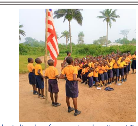
Students lined up for morning devotion at Toe Gbardee Memorial UMS.