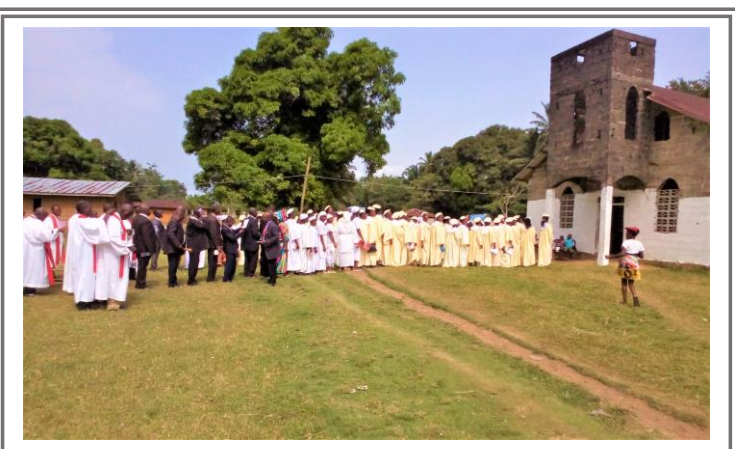
The choir led the procession into the Martha Nah United Methodist Church building for the closing worship service of the Nana Kru District Conference on February 7, 2021.