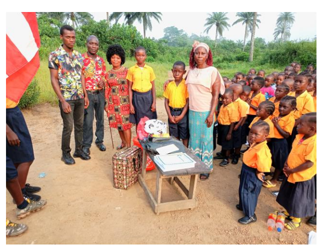
Teachers and students gathered to receive supplies for Toe Gbardee Memorial United Methodist School.