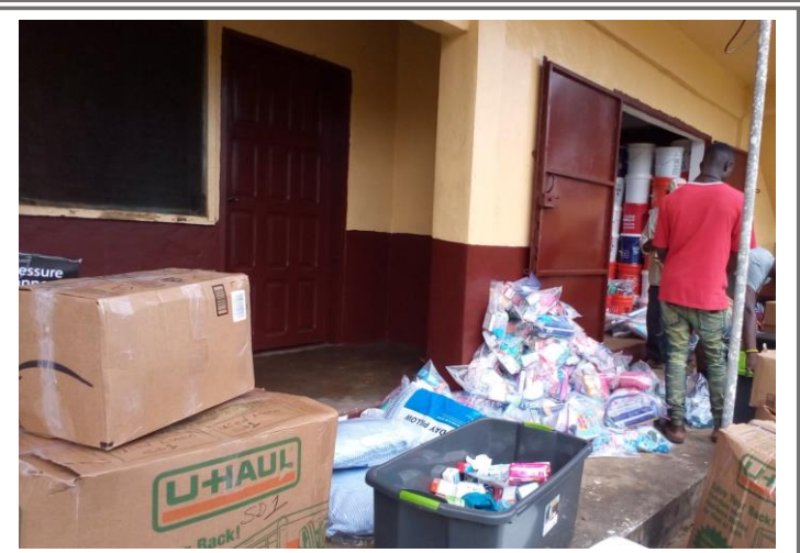
Sorting supplies from the Holston Conference.

"Because of the Lord's great love we are not consumed, For his compassions never fail. They are new every morning; Great is your faithfulness." Lamentations 3:22-24(NKJV)