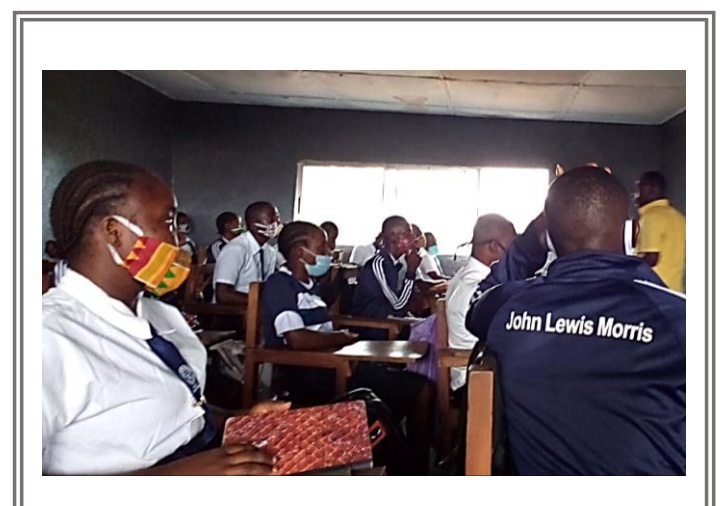
12<sup>th</sup> grade students at John Lewis Morris UMS in Paynesville (the city next to Monrovia) wear masks in class.