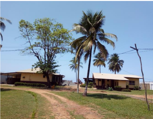
Working from home, listening to the waves, feeling the ocean breeze, and thanking God for His peace.