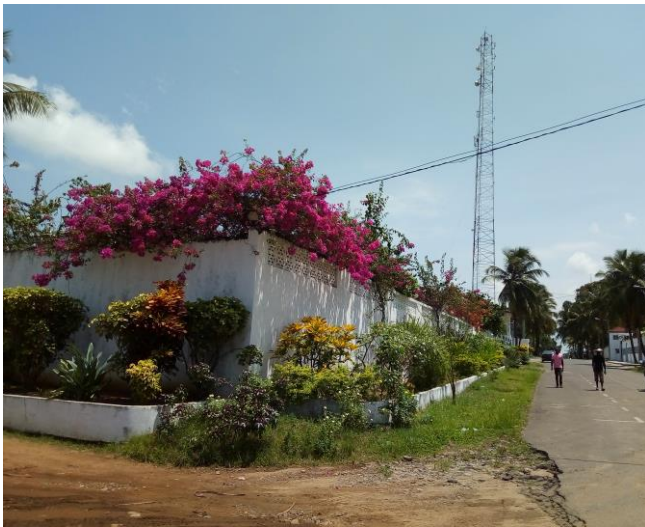
Every time I walk down my street, I am thankful for the beauty of God's creation and know that God is still in control.