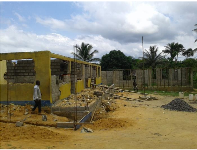
The United Methodist Development Services is currently expanding the Gretta Moffat UMS in John Dean Town.

“Peace I leave with you. My peace I give to you; not as the world gives do I give to you. Let not your heart be troubled, neither let it be afraid.” John 14:27 (NKJV)