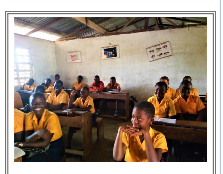
Children in class at Sanniquellie UMS.

the church building. The landlord is no longer renting the house and the Ministry of Education does not allow schools to have classes in church buildings, so the new school building is very much needed.