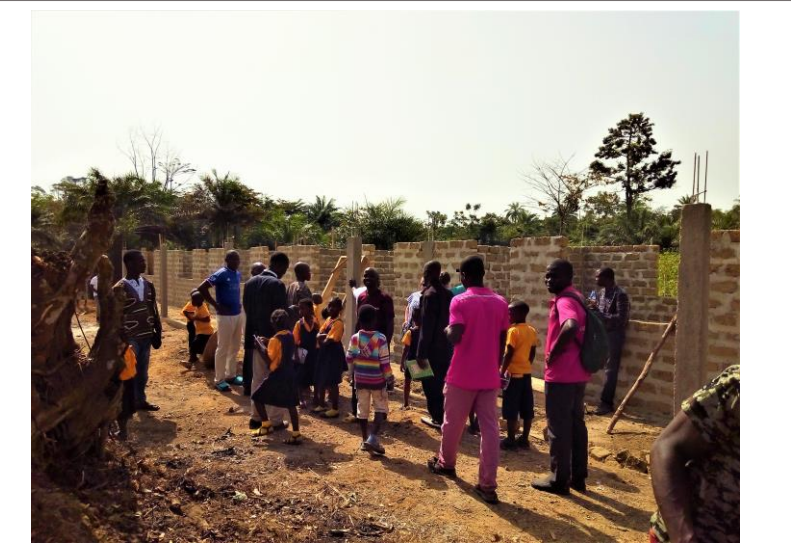
Korsen UMS students and staff at construction site of new school building.

This congregation also sent funds to construct a school building for Korsen UMS in Nimba County. Last year, I shared that Korsen UMS was having classes in a rented house and in