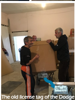
The old license tag of the Dodge

boxes are stored and reused, as they are great to store the Christmas boxes and to be used during the distribution for sorting the Christmas Boxes by sex and age. When you exactly know where to find boxes of certain age groups, it makes the work quick, much effective and efficient, especially knowing that there are at least hundred people waiting in the cold to get so much dreamed Christmas Boxes.