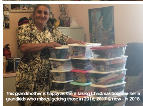
This grandmother is happy as she is taking Christmas boxes to her 5 grandkids who missed getting those in 2016, 2017 & now - in 2018.