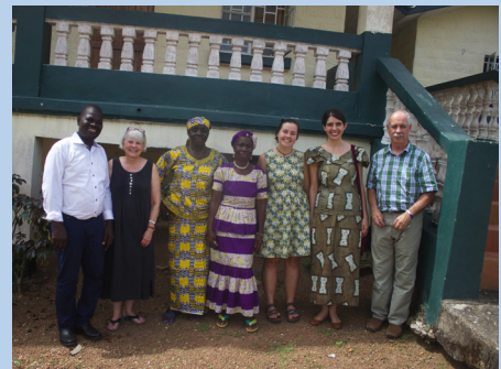
A 2016 Mission Team