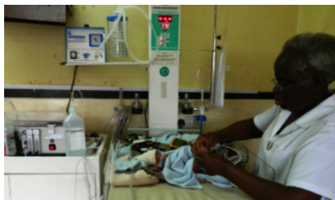
A CPAP machine in use.

MOH is sending $5,000 per month, which pays for all staff except the doctor. This includes a newly hired nurse anesthetologist, and an OR nurse. In addition the following equipment has been purchased – an ultrasound, cautery, two maternity beds, and a CPAP (to help newborns to breath).