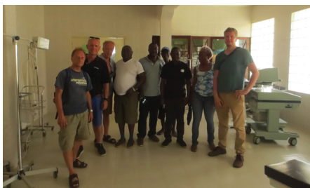
Norway team at Rotifunk