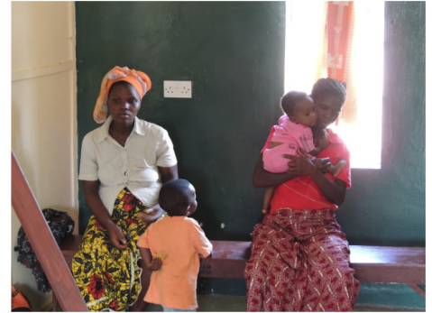
Mothers and children wait for services at Rotifunk Hospital.

The hospital health board and leadership continue to work toward starting surgery in the OR. Other hospital representatives tell us this is a sure way to increase patients. A nurse anesthetist and OR nurse have been hired, and all necessary equipment purchased.