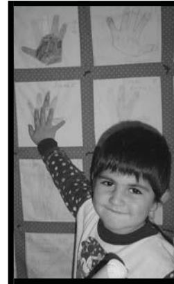
God continues to call us to ministry in Armenia. On this Sunday, we celebrate our mission there!

Project AGAPE is making a difference in the lives of thousands of people in Armenia and Karabagh. We are the only organized group serving in the Karabagh region. United Methodists from across North Carolina continue to support our brothers and sisters assisting in empowerment ministries in housing reclamation of bombed-out buildings and live-stock husbandry. Your gifts also provide medical care for poor children and Christian education in this oldest of Christian nations.