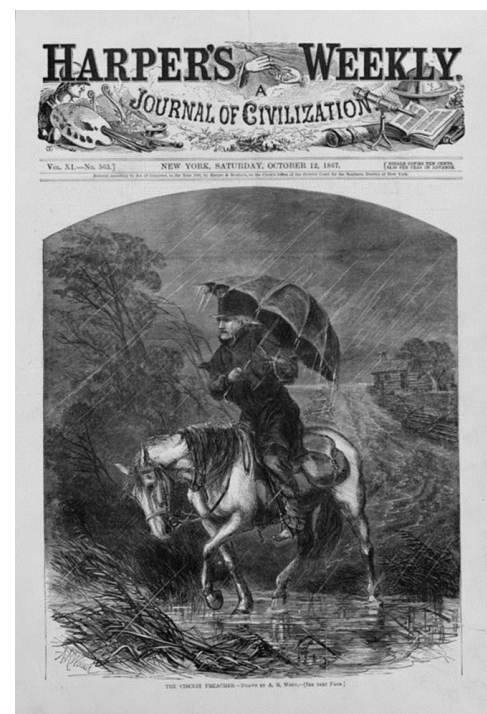
Picture of a Methodist Circuit Rider, Published in Harper's Weekly in 1867.