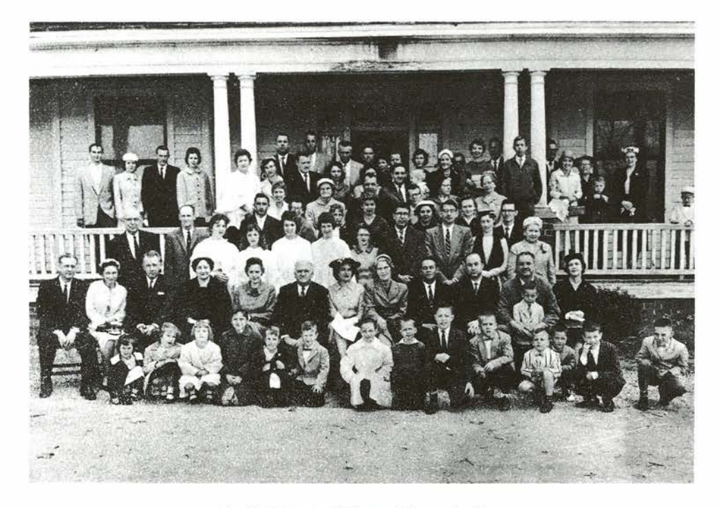
April 10, 1960 Formal Organization