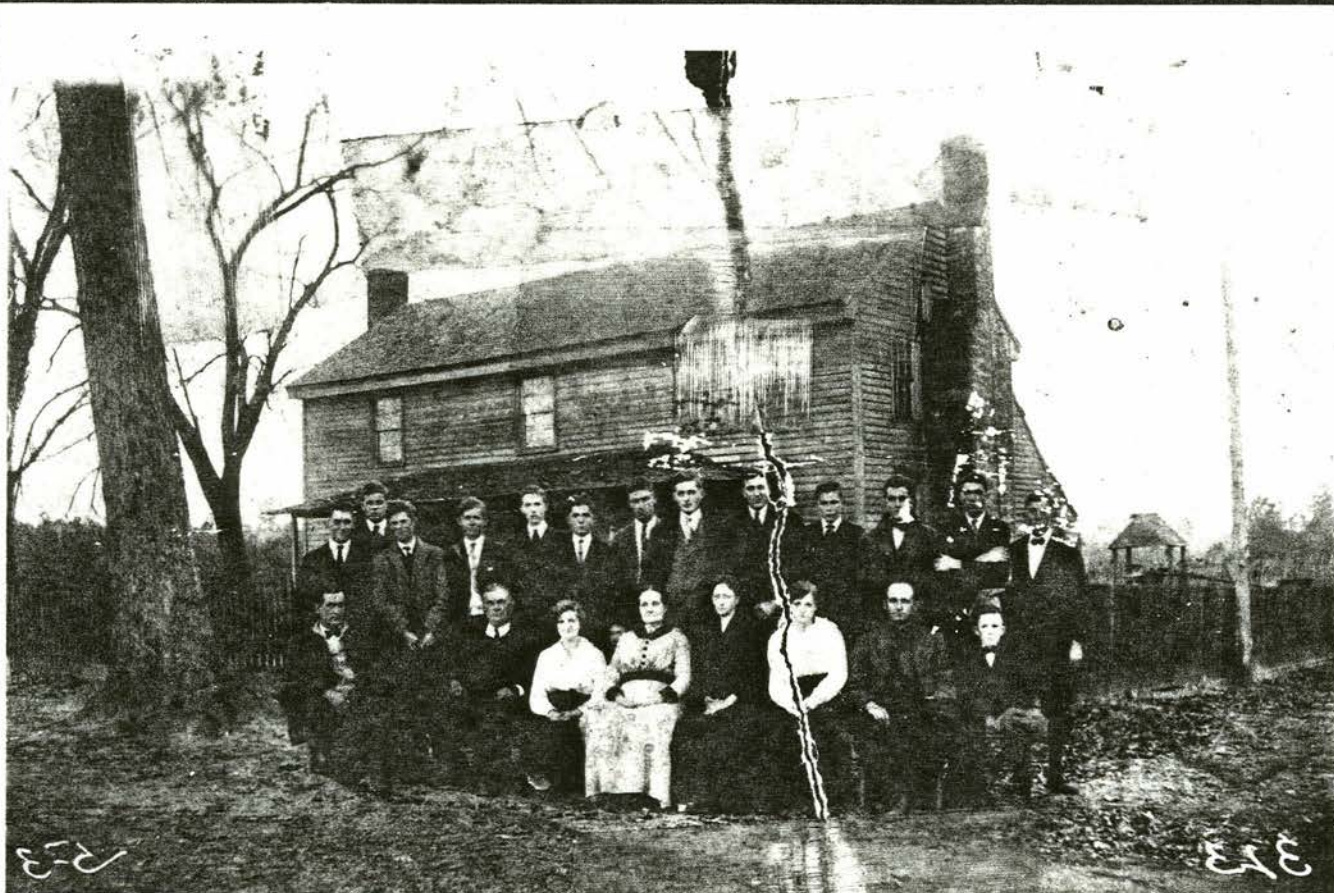
WESLEY'S CHAPEL CHURCH AND SUNDAY SCHOOL CLASS-CA. 1918