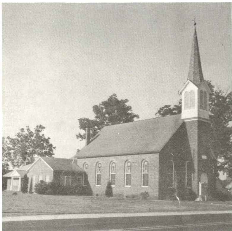
NEW TRINITY CHURCH