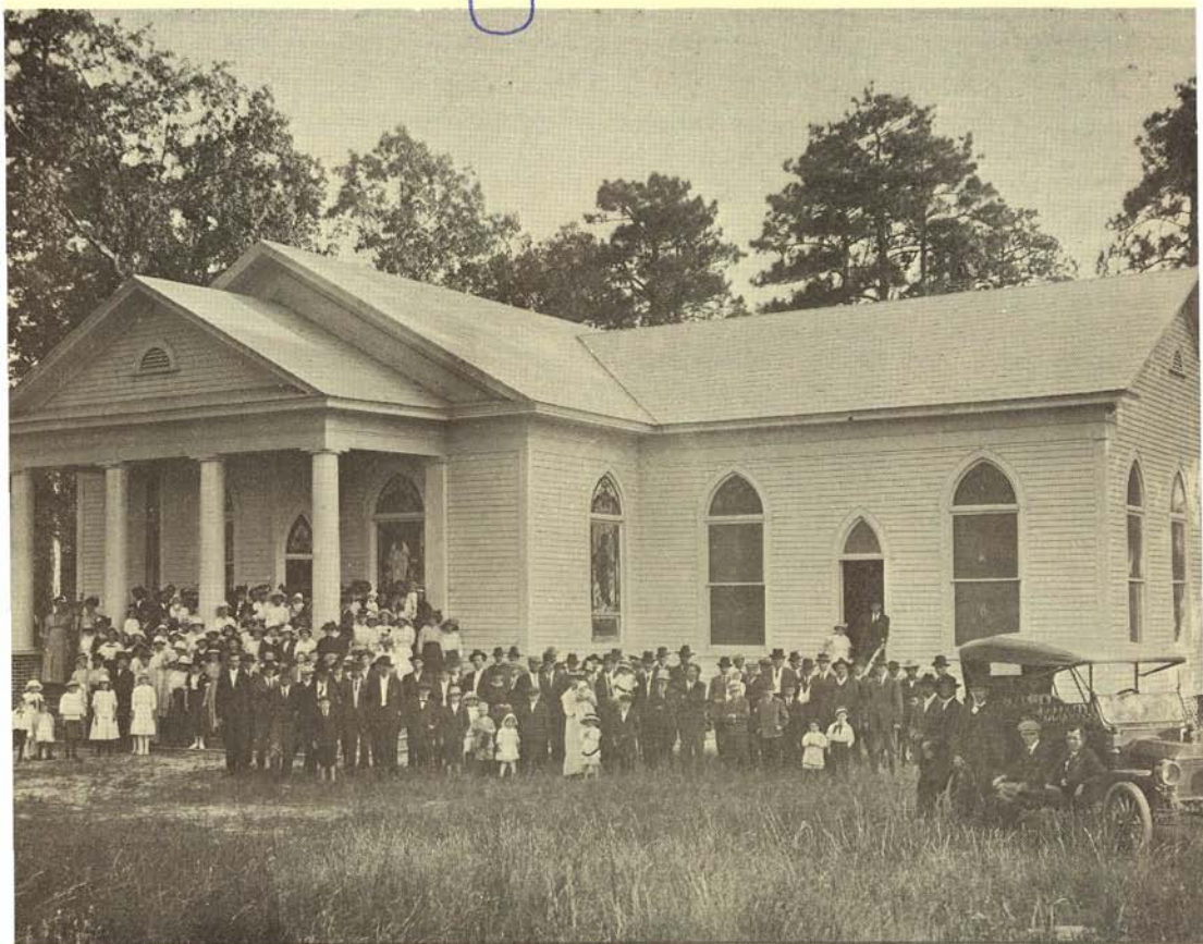
ST. JOHN AS IT WAS IN 1914