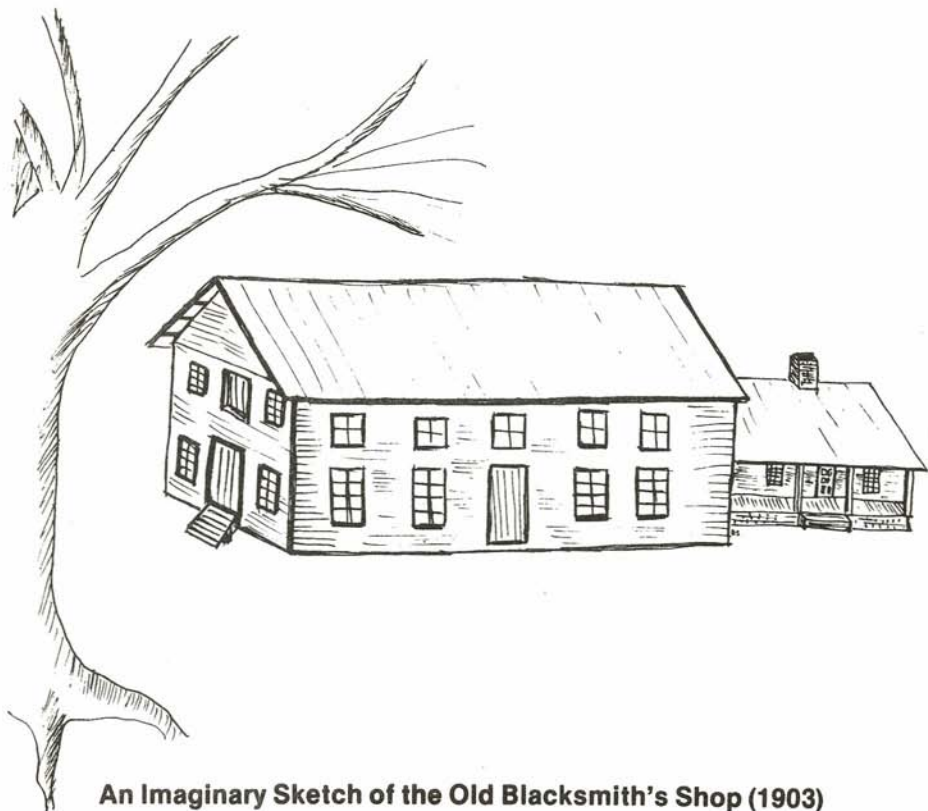
An Imaginary Sketch of the Old Blacksmith's Shop (1903)

Thus from those meager beginnings over a blacksmith's shop seventy-five years ago, comes a thriving, well-established church which seeks to point all to a Savior of love and great compassion. We can say with Jacob of old, "Surely the Lord is in this place, for this is none other but the House of God."