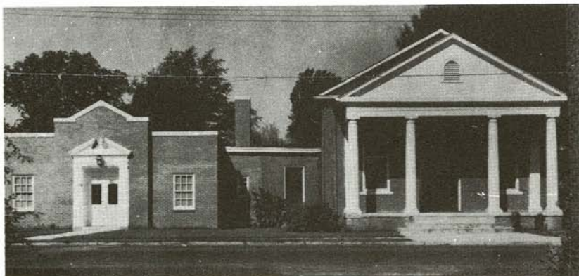
Church and Education Building (1957)