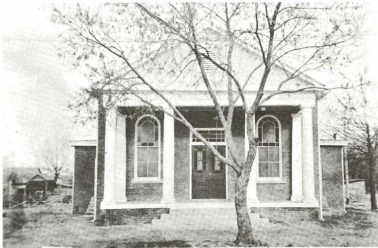
Remodeled Church (1923)