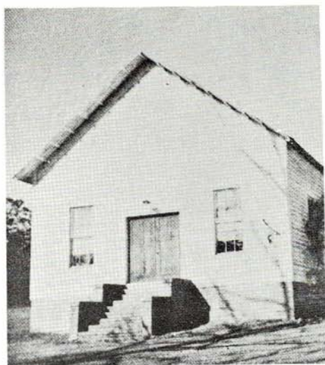
Little River's First Building