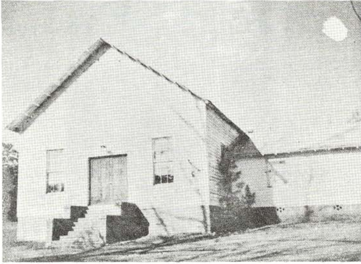
Little River's First Building Renovated