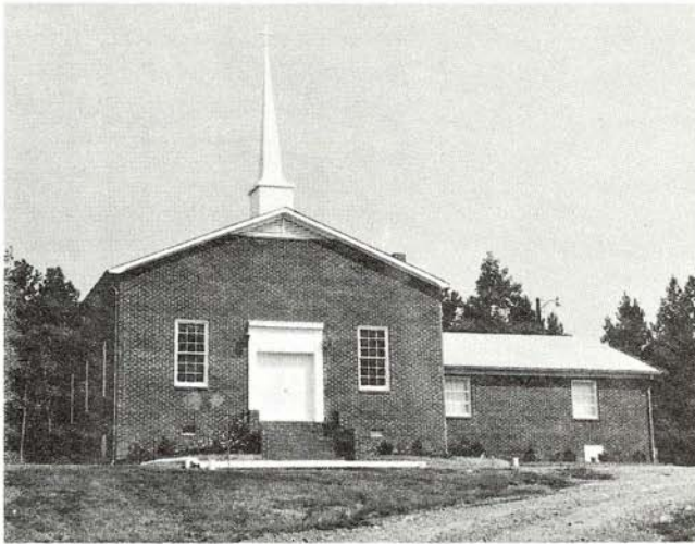
Little River United Methodist Church Today