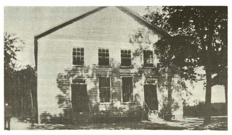
Old Church Building