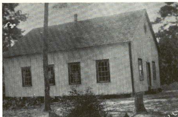
OLD ROCKY RUN SCHOOL First Services of Bethlehem Church were held in this School