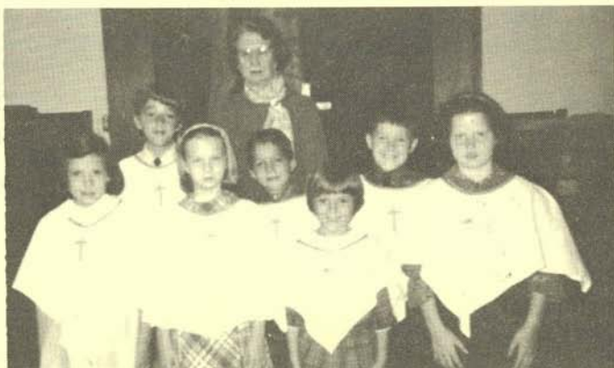
Bethel Junior Choir