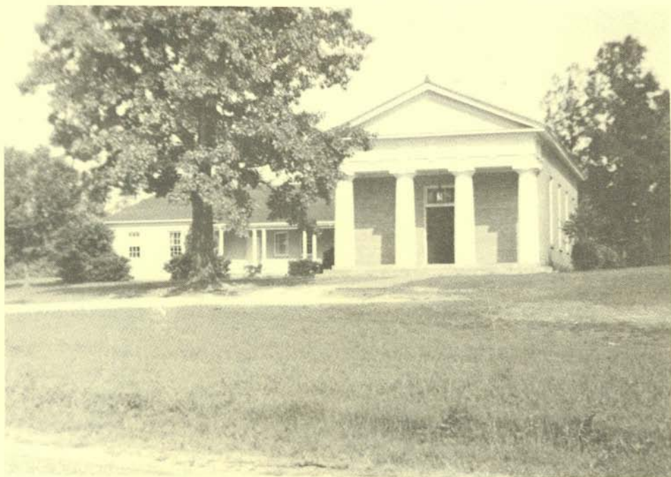
Picture of the new church before the oak tree was cut down.