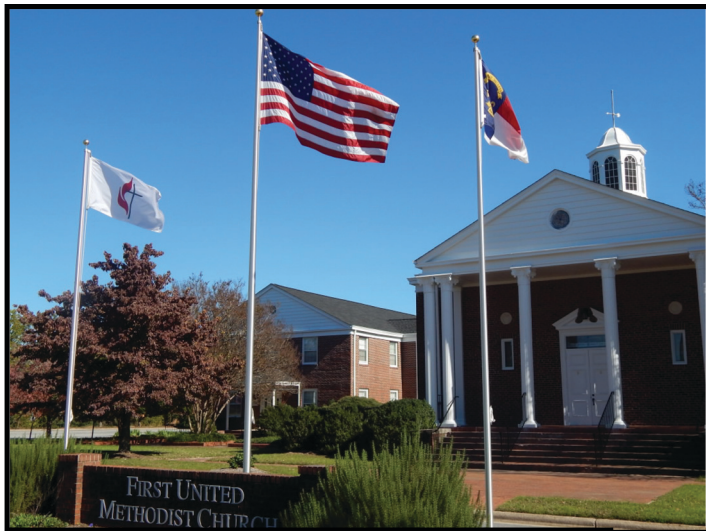
Our thanks to First UMC - Fuquay Varina - Fuquay Varina for hosting the spring meeting.