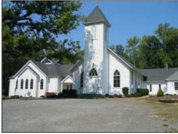
Thank you, Pleasant Green UMC, for hosting our meeting in April 2010