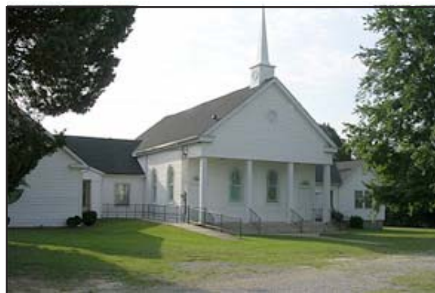
Thank you, Jerusalem UMC, for hosting our meeting in May 2009