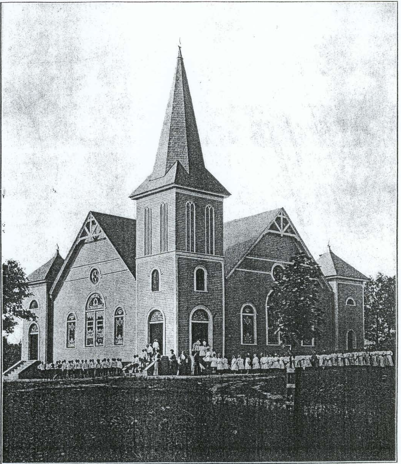
JENKINS MEMORIAL CHURCH